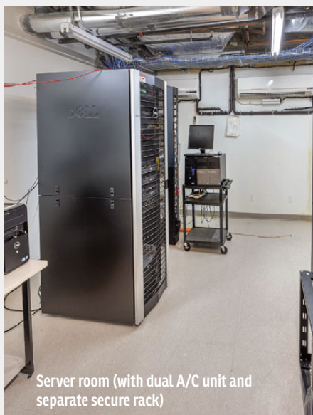
Server room (with dual A/C unit and separate secure rack)