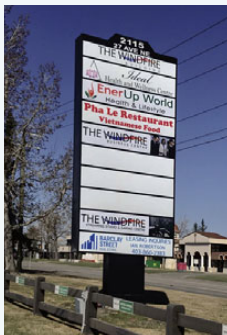
Pylon Signage available