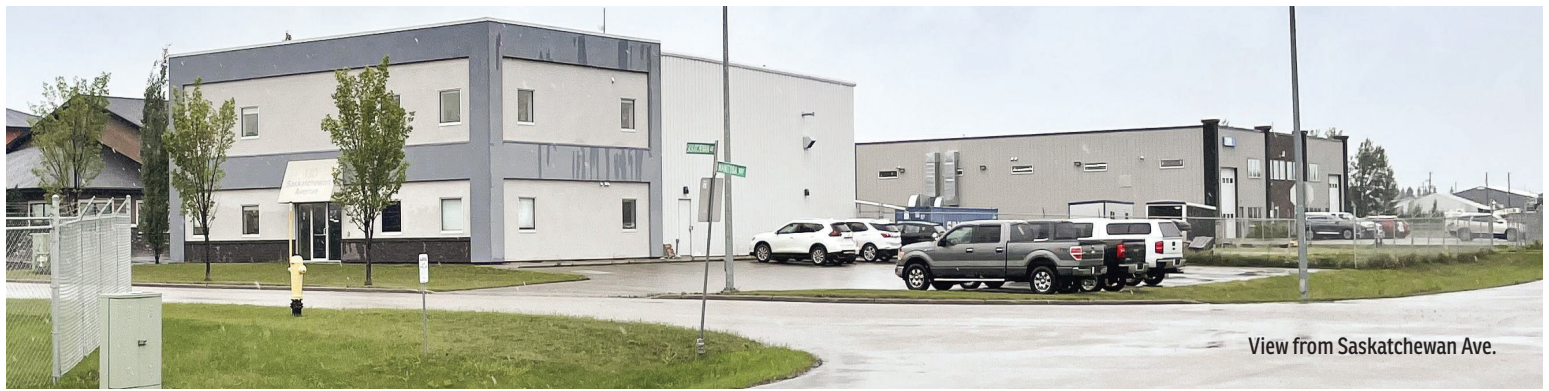
View from Saskatchewan Ave.