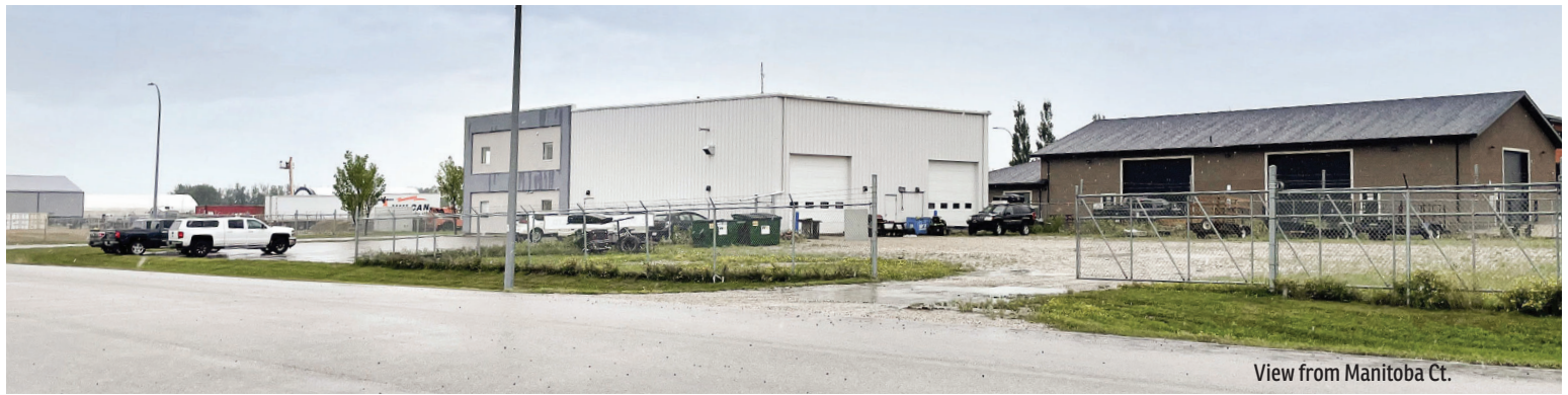
View from Manitoba Ct.