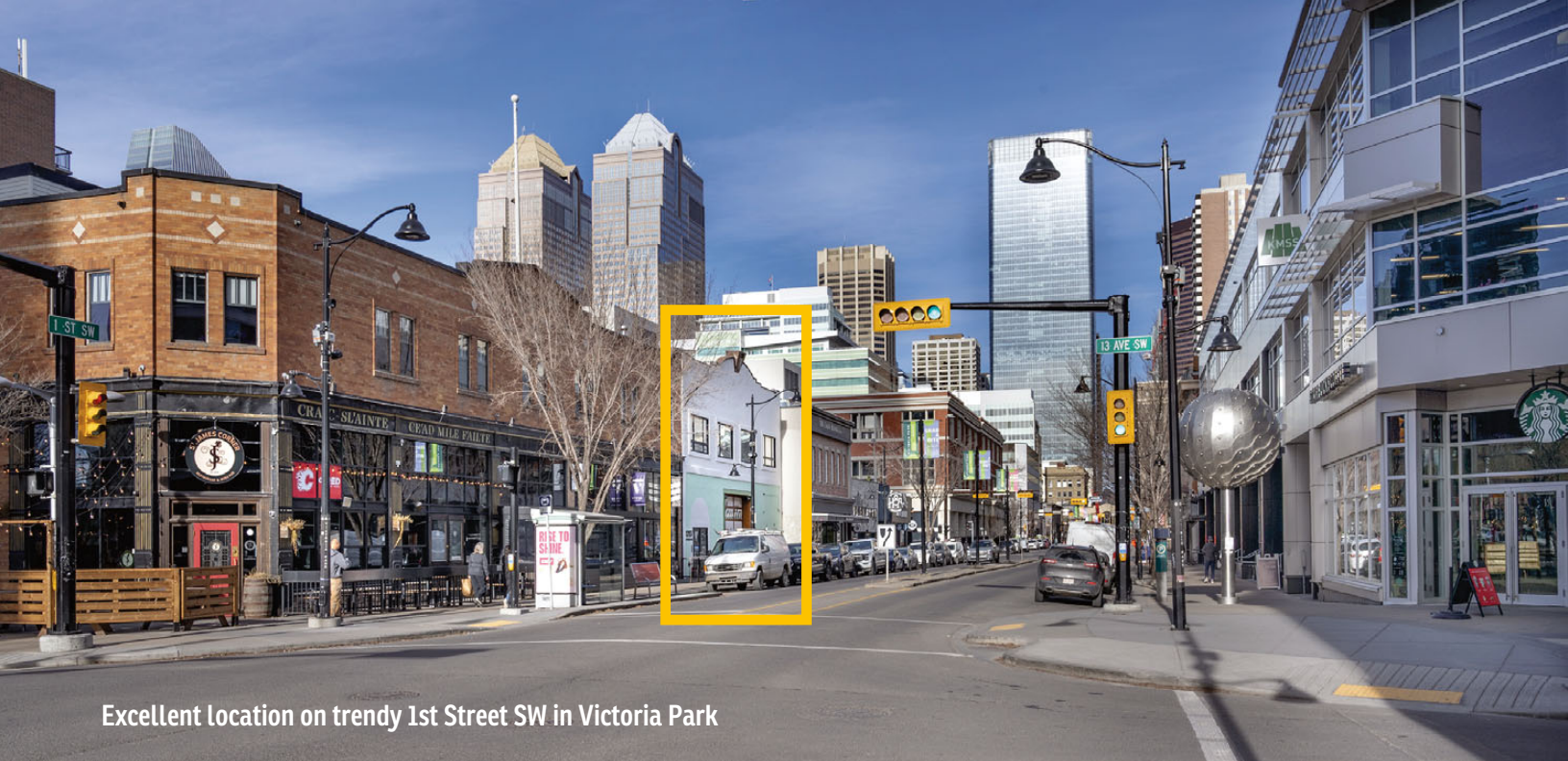
Excellent location on trendy 1st Street SW in Victoria Park